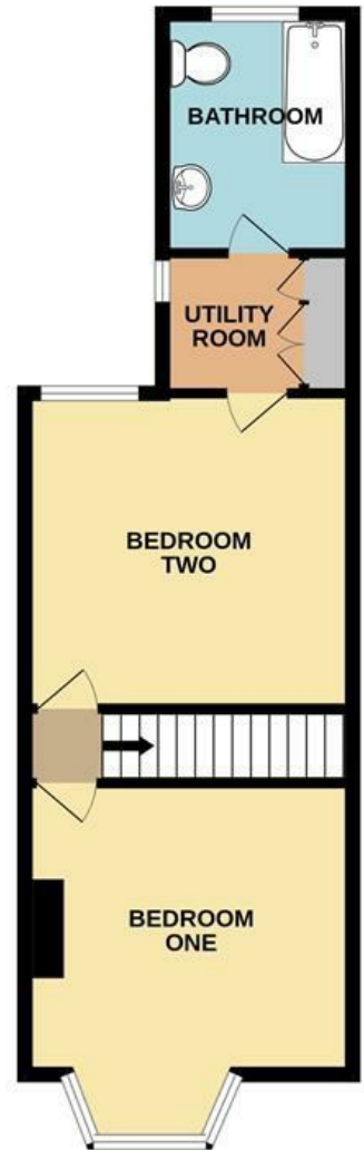
1ST FLOOR 432 sq.ft. (40.2 sq.m.) approx.

TOTAL FLOOR AREA : 940 sq.ft. (87.4 sq.m.) approx. Whilst every attempt has been made to ensure the accuracy of the floorplan contained here, measurements of doors, windows, rooms and any other items are approximate and no responsibility is taken for any error, omission or mis-statement. This plan is for illustrative purposes only and should be used as such by any prospective purchaser. The services, systems and appliances shown have not been tested and no guarantee as to their operability or efficiency can be given. Made with Metropix ©2023