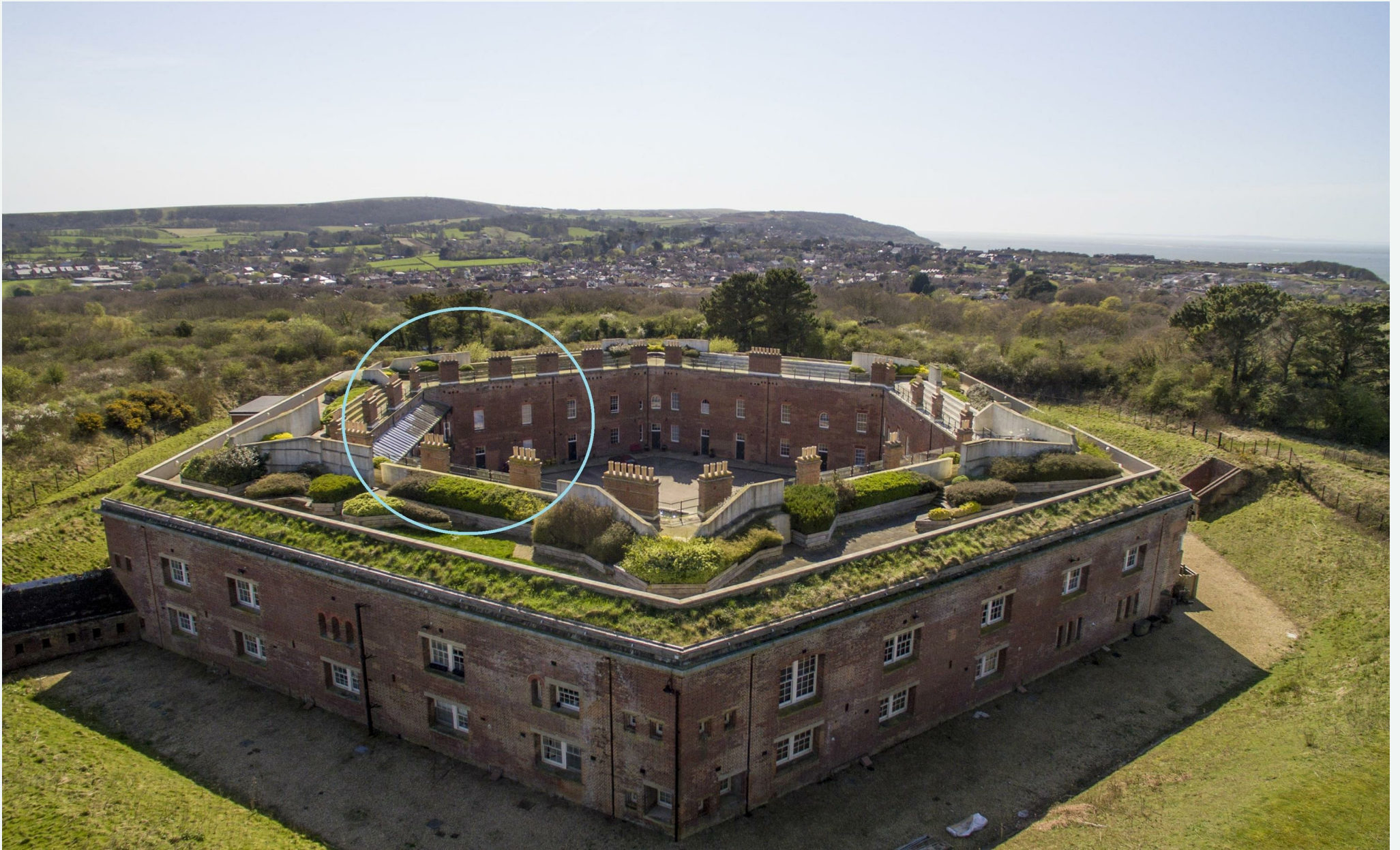
12 Golden Hill Fort, Freshwater, Isle of Wight, PO40 9GD