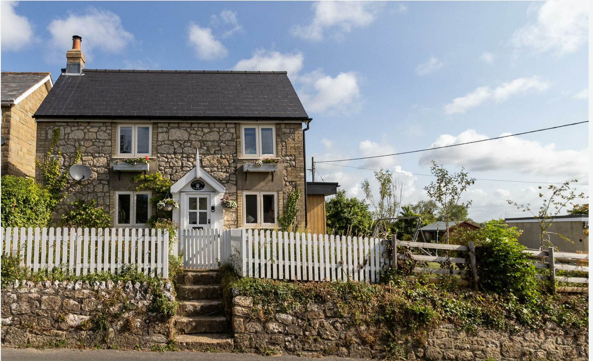
Lavender Cottage, Newbridge, Isle of Wight