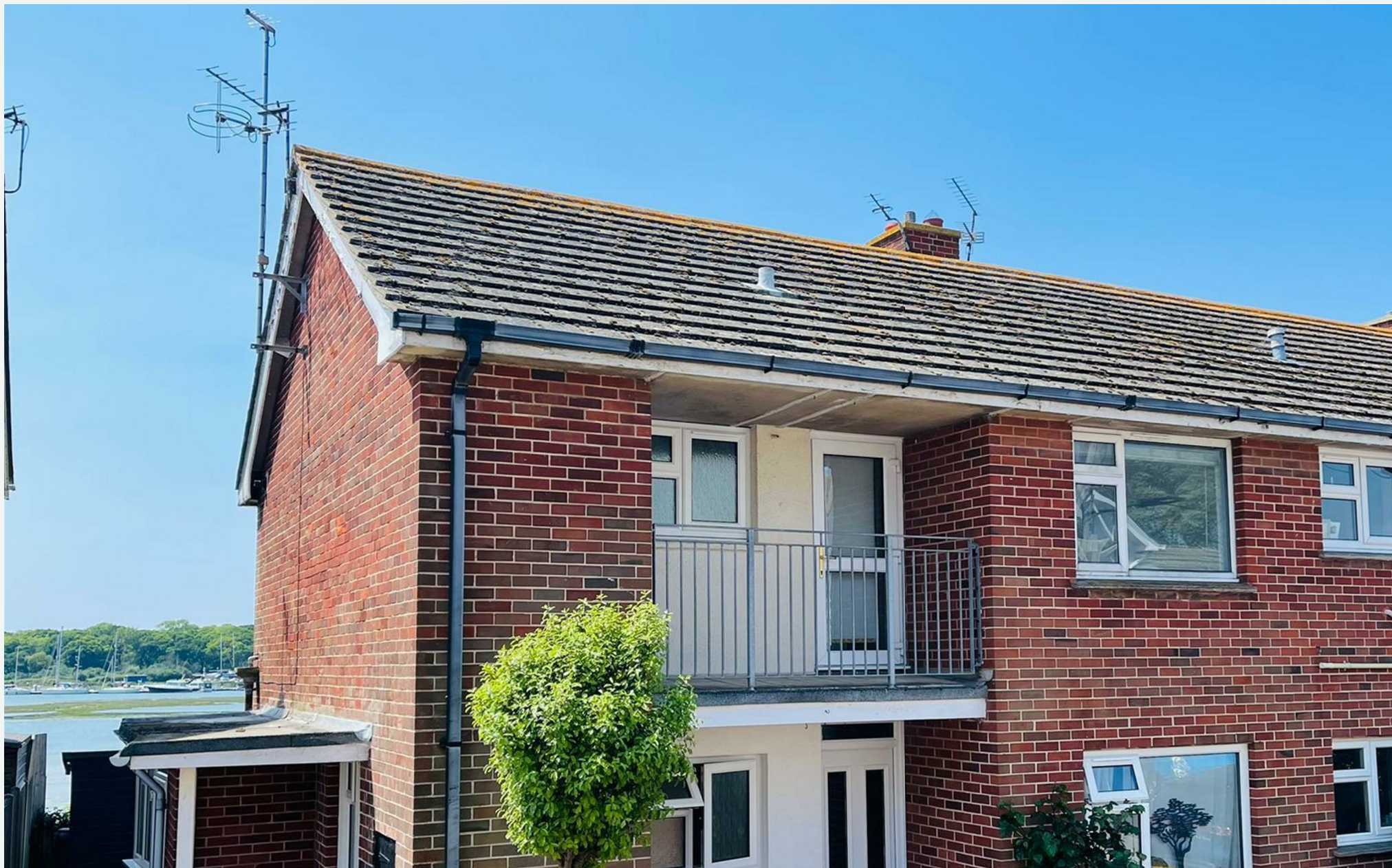
1 Tides Reach, Yarmouth, Isle of Wight