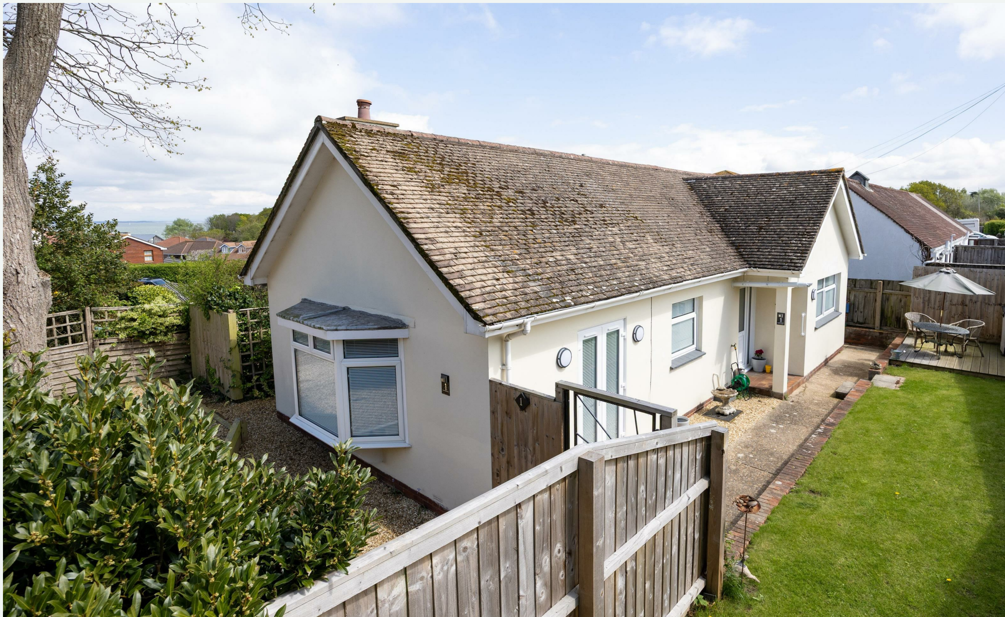
1 Port La Salle, Yarmouth, Isle of Wight