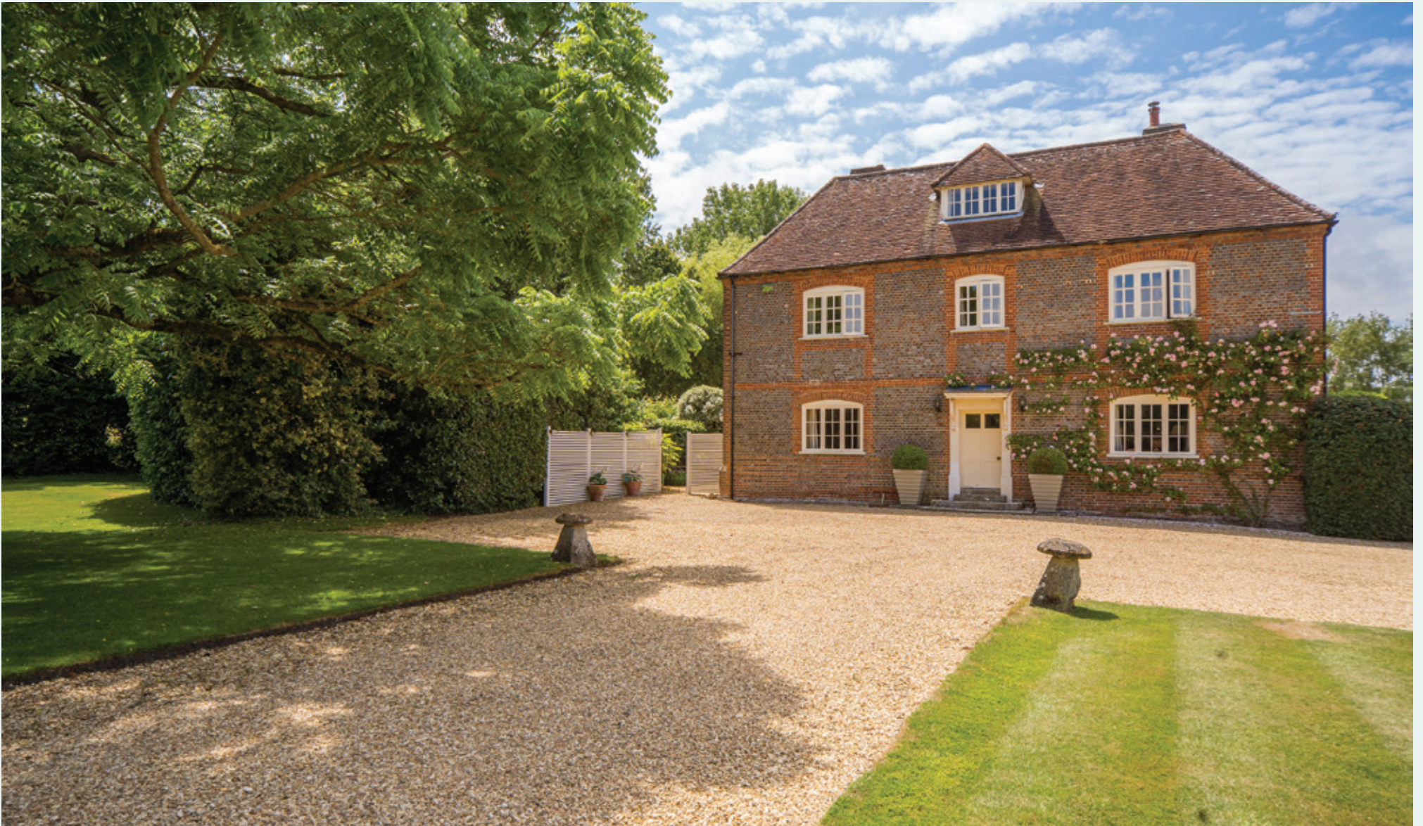
Watchingwell Manor, Calbourne, Newport, Isle Of Wight