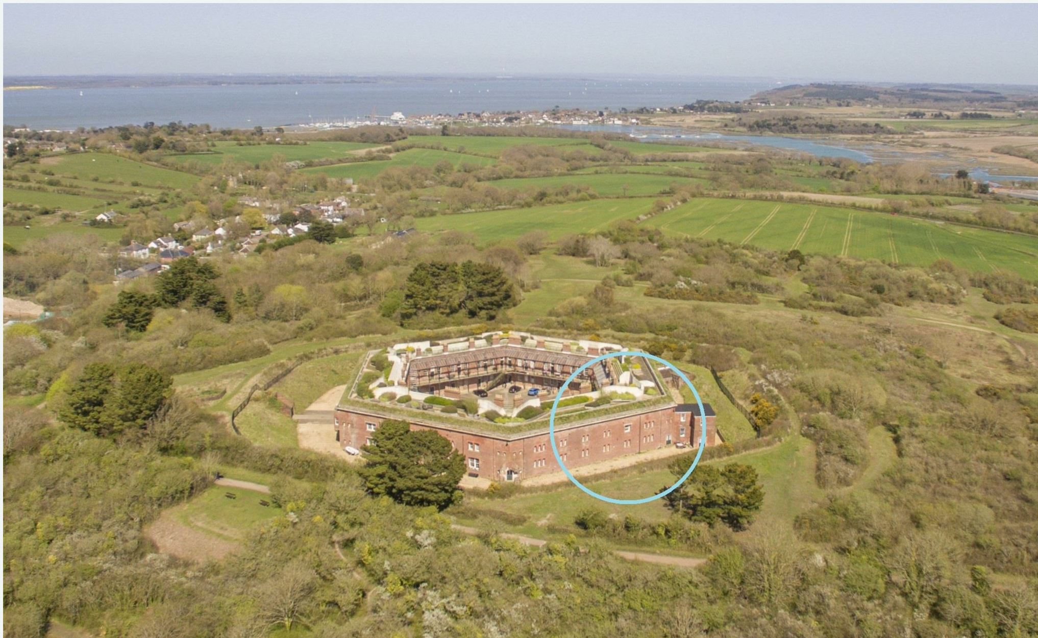
15 Golden Hill Fort, Freshwater, Isle of Wight