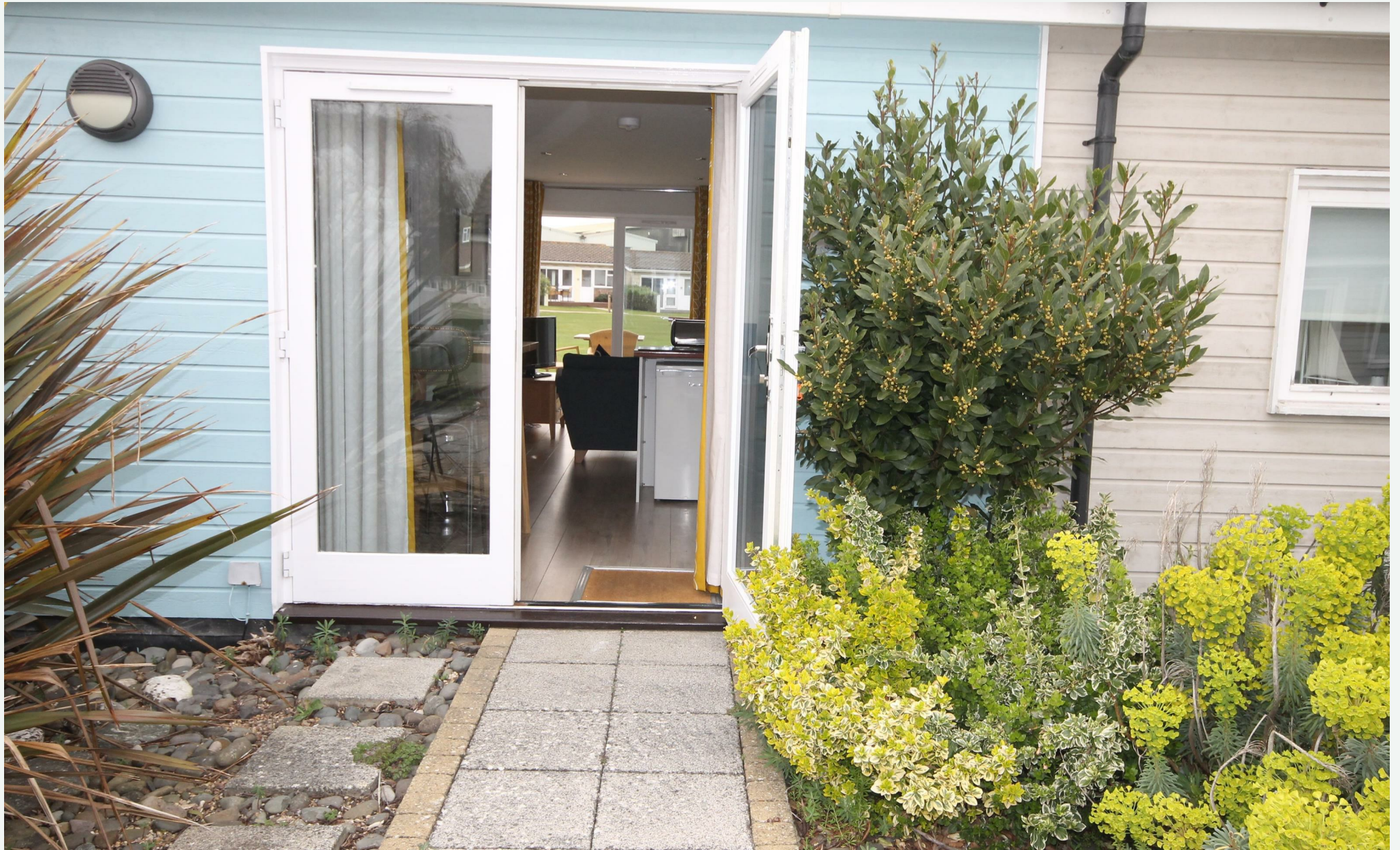
Saltbox B7 The West Bay, Halletts Shute, Yarmouth, Isle Of Wight, PO41 0RJ