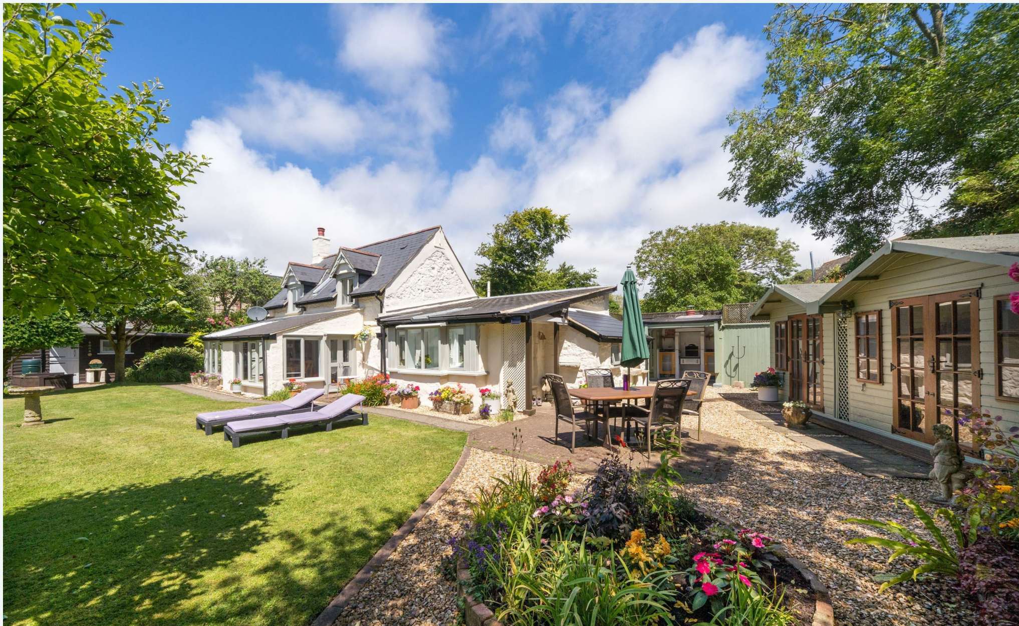
Fishers Cottage, Brighstone, Isle of Wight