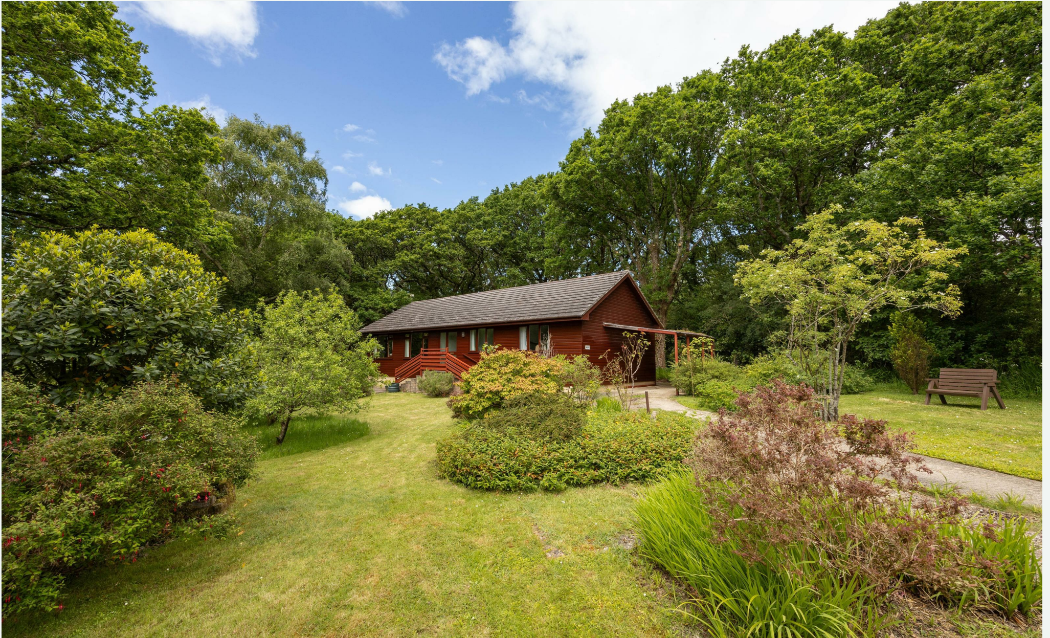
Alleyn, Cranmore, Isle of Wight