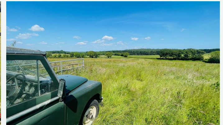
Land Opposite Whitehouse Farm, Newport, Isle of Wight