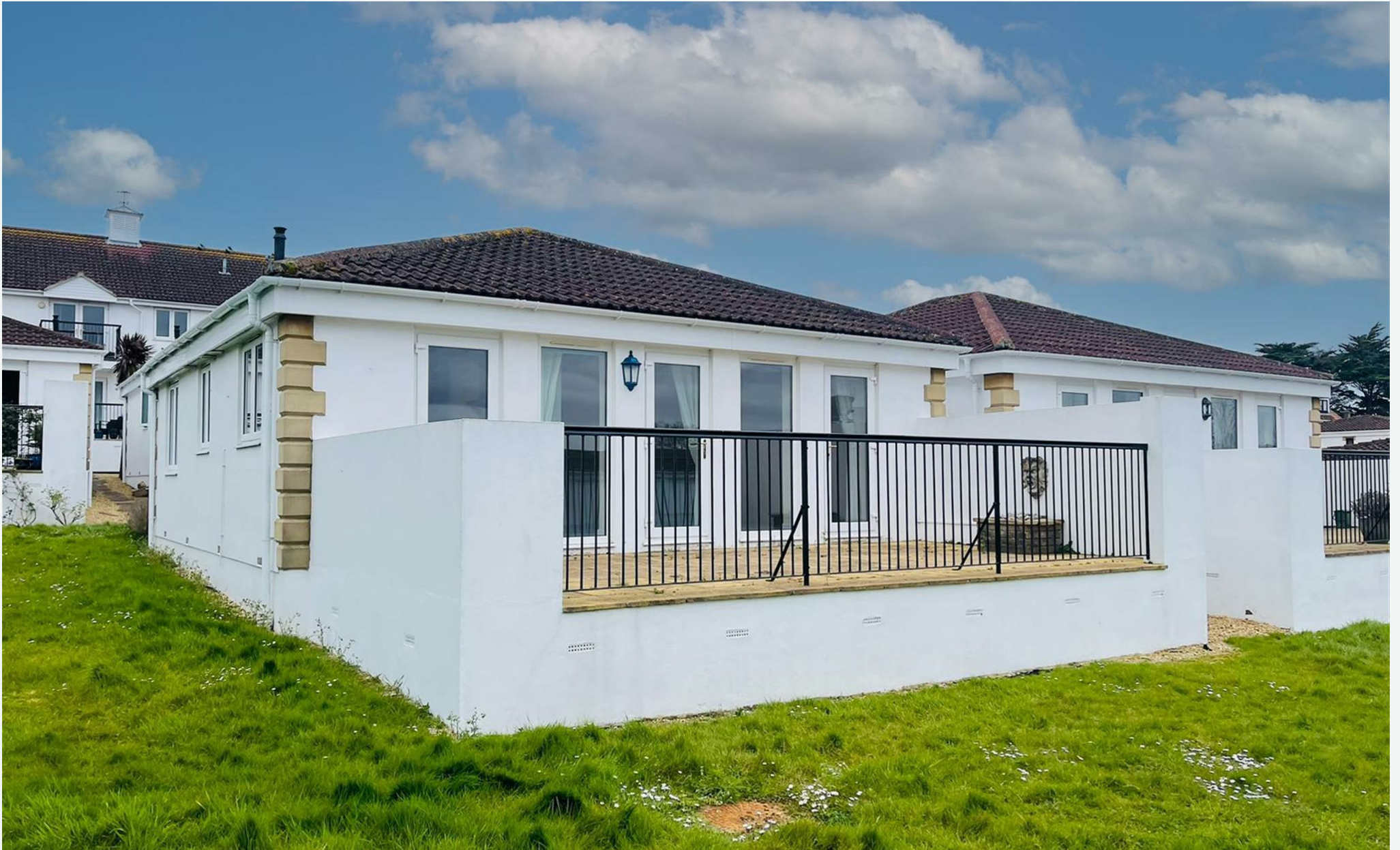
24 The Vineyard, Yarmouth, Isle Of Wight, PO41 0XE