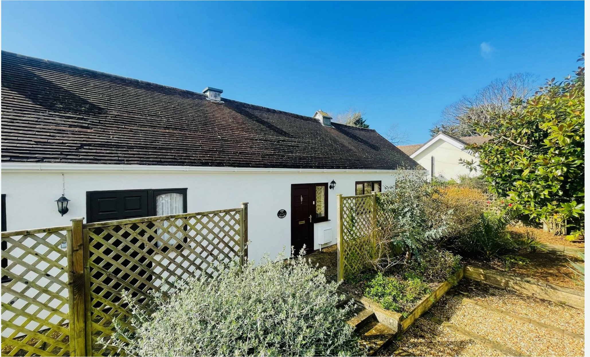
Sage Cottage, The Vineyard, Yarmouth, Isle of Wight, PO41 0XE