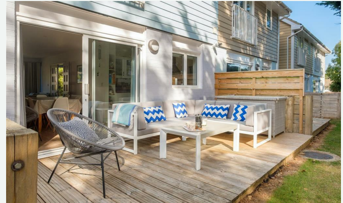
Whitfield P1, Yarmouth, Isle of Wight, PO41 0RJ