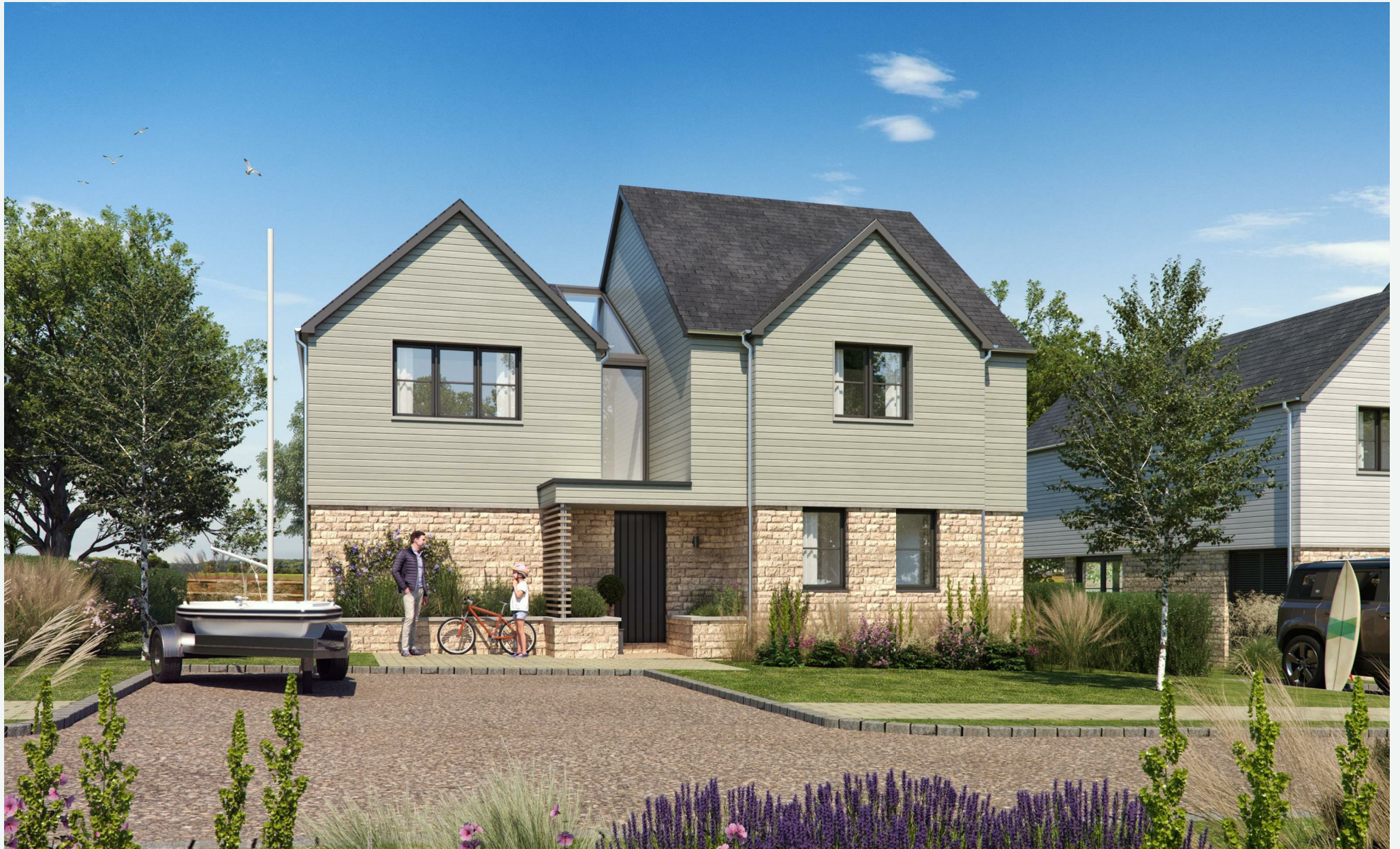
Seabrooke Plot 22 The Salterns at West Bay, Halletts Shute, Yarmouth, Isle Of Wight, PO41 0RJ