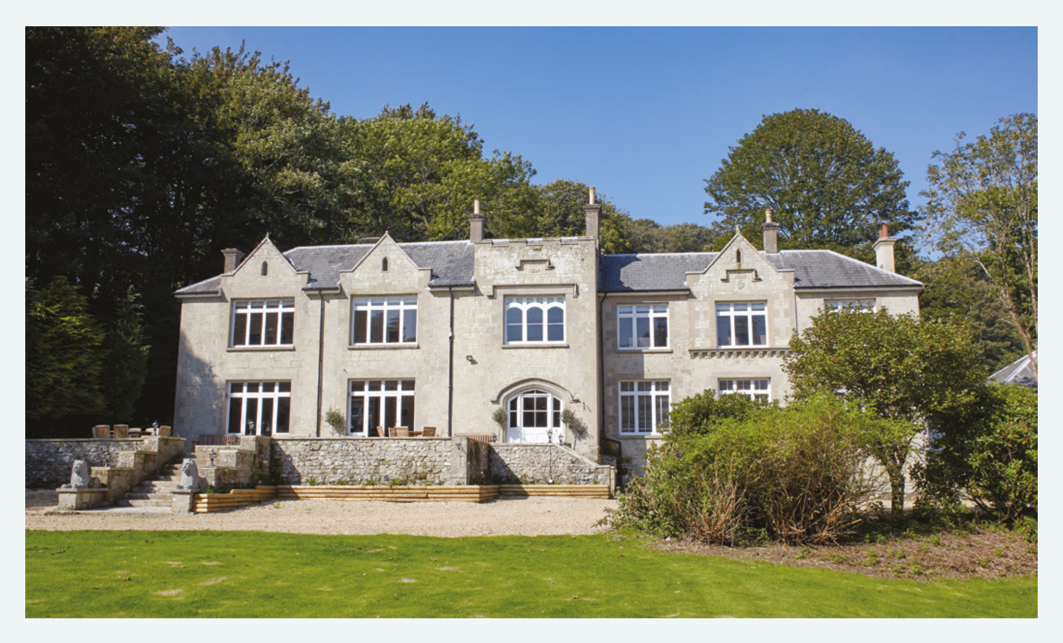
The Hermitage, Whitwell, Isle Of Wight