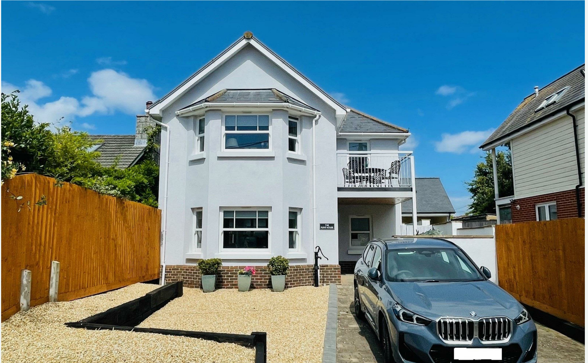
The Pump House, Yarmouth, Isle of Wight, PO41 0QZ