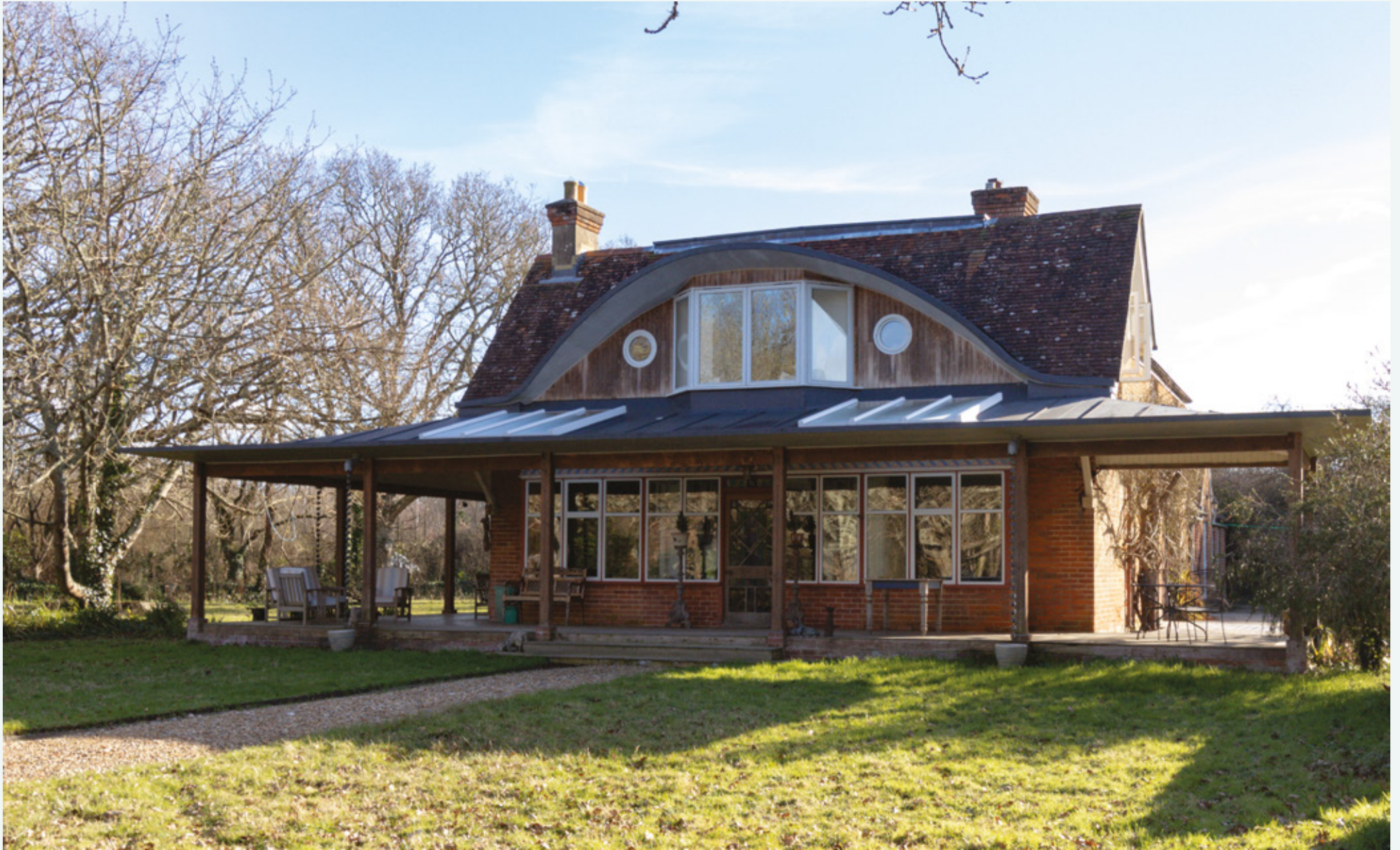
Mole Hill, Cranmore, Isle of Wight