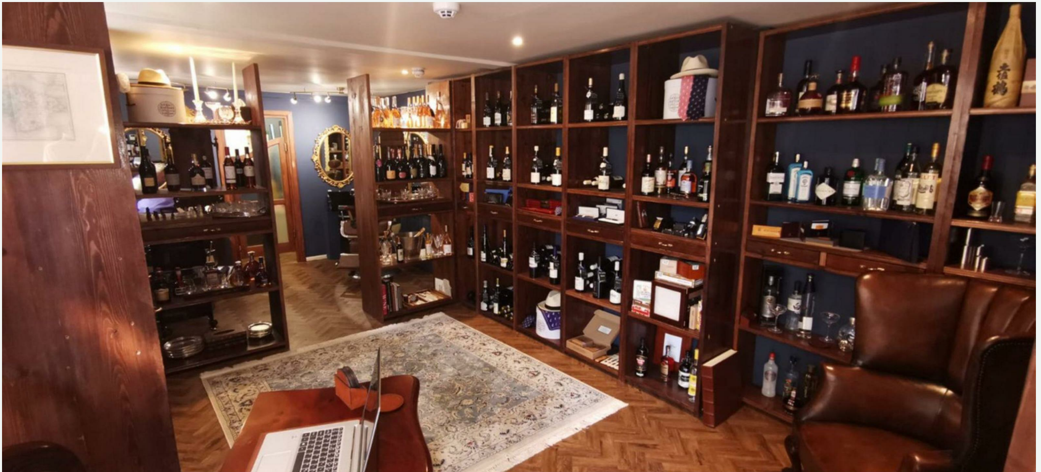
The Yarmouth Barbers & Connoisseurs Shop, Yarmouth, Isle of Wight, PO41 0NR