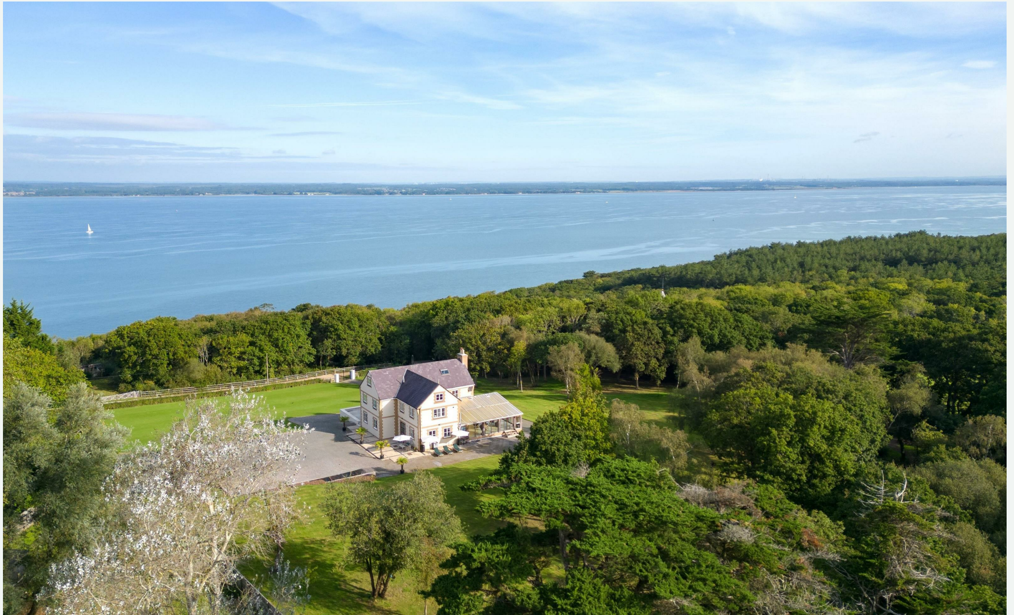
Greenwood House Seaview Road, Cranmore, Isle of Wight, PO41 0XU