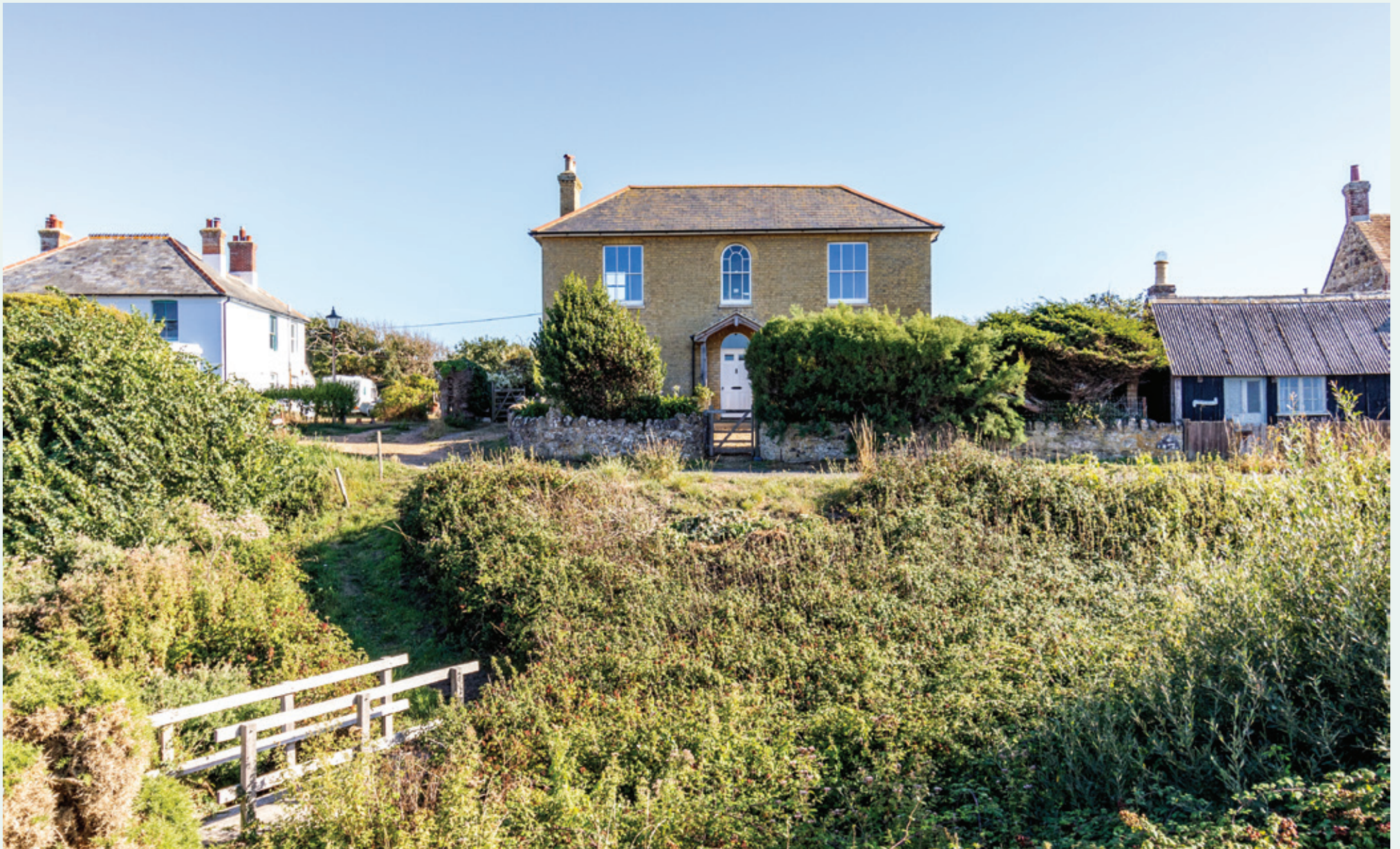
Chine Lodge, Brook Chine, Brook, Isle of Wight