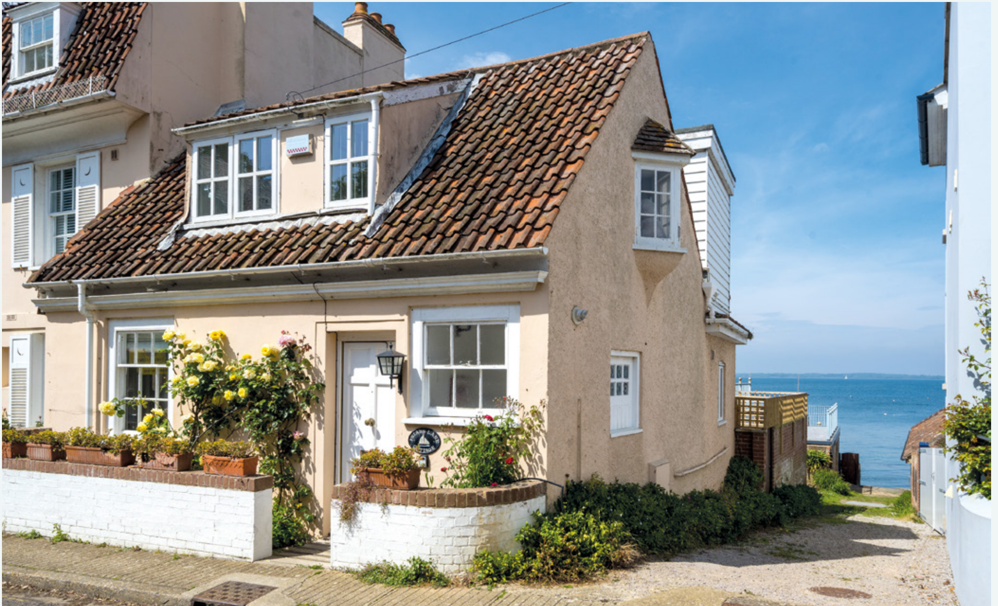
Friars Lane Cottage, High Street, Yarmouth, PO41 0PN