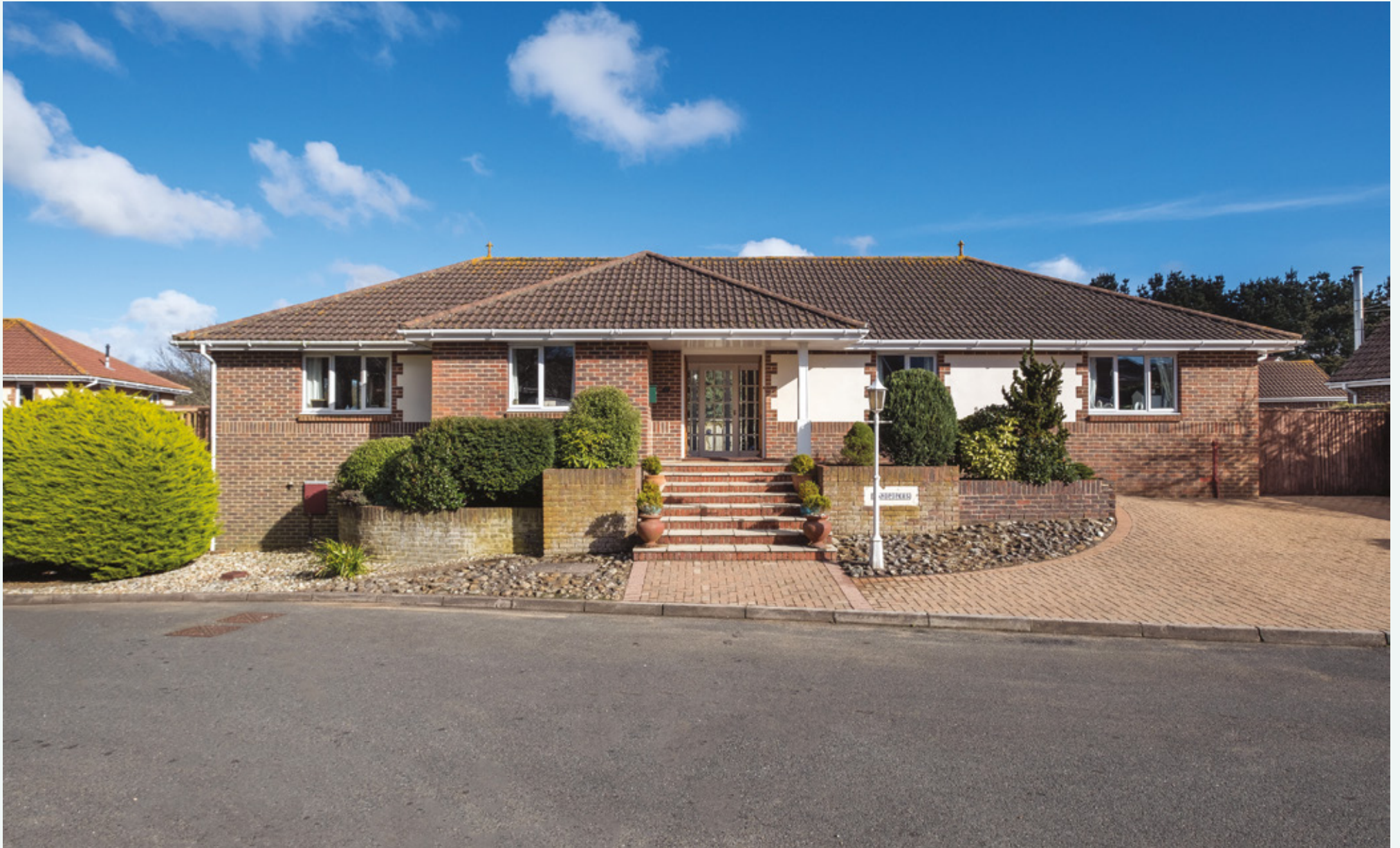
Sandpipers, 12 Waters Edge, Bouldnor, Yarmouth, Isle Of Wight, PO41 0XB