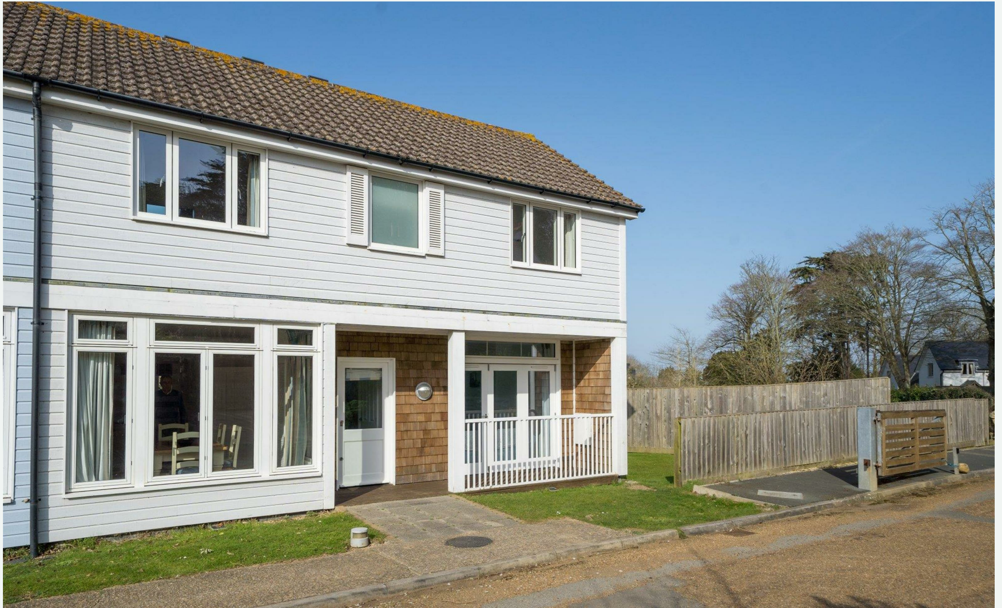
Piedmont K1 The West Bay, Norton, Yarmouth, Isle Of Wight, PO41 0RJ