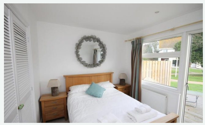
N3 Plimoth, Halletts Shute, Norton, Yarmouth, Isle of Wight, PO41 0RJ