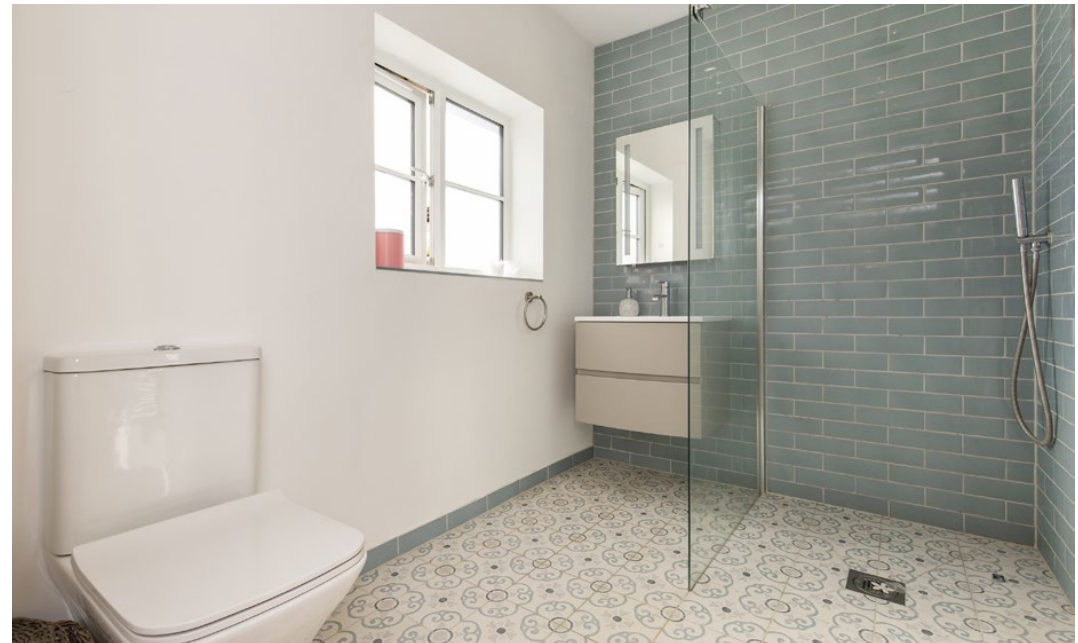
Bedrooms with En Suites