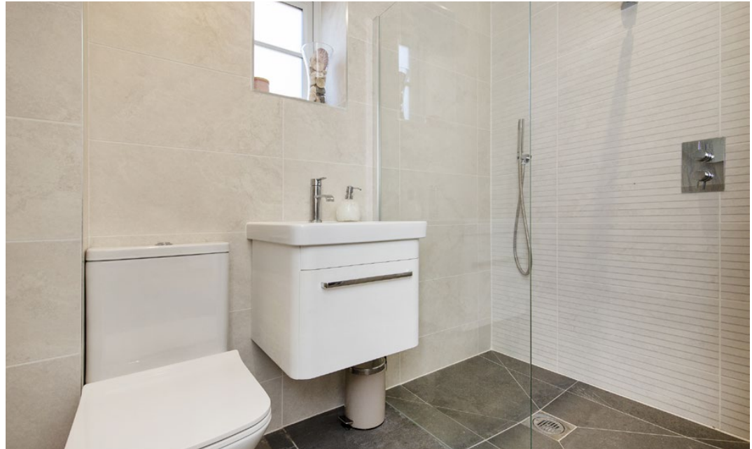
Other Ground Floor Images