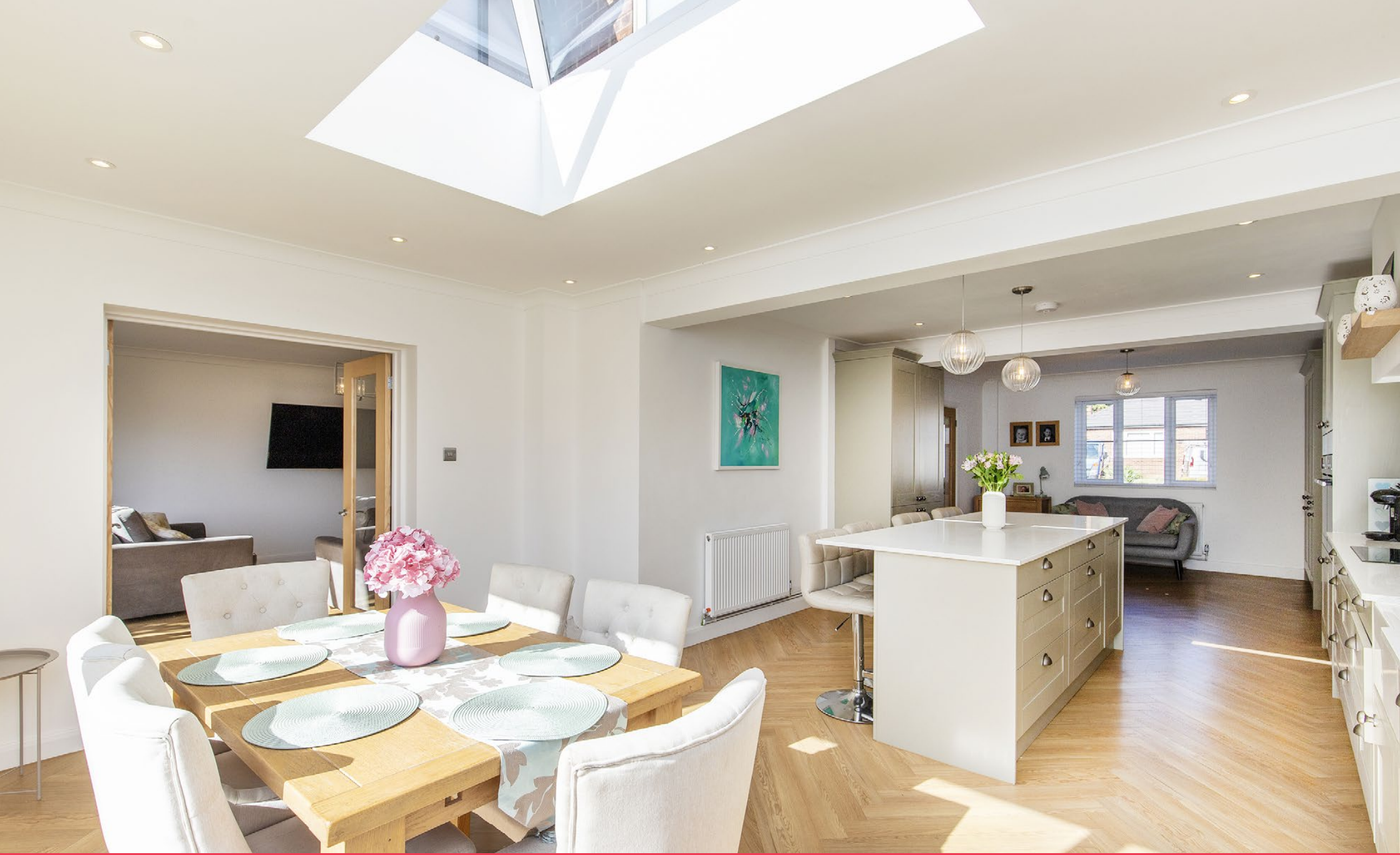
Kitchen / Dining Room