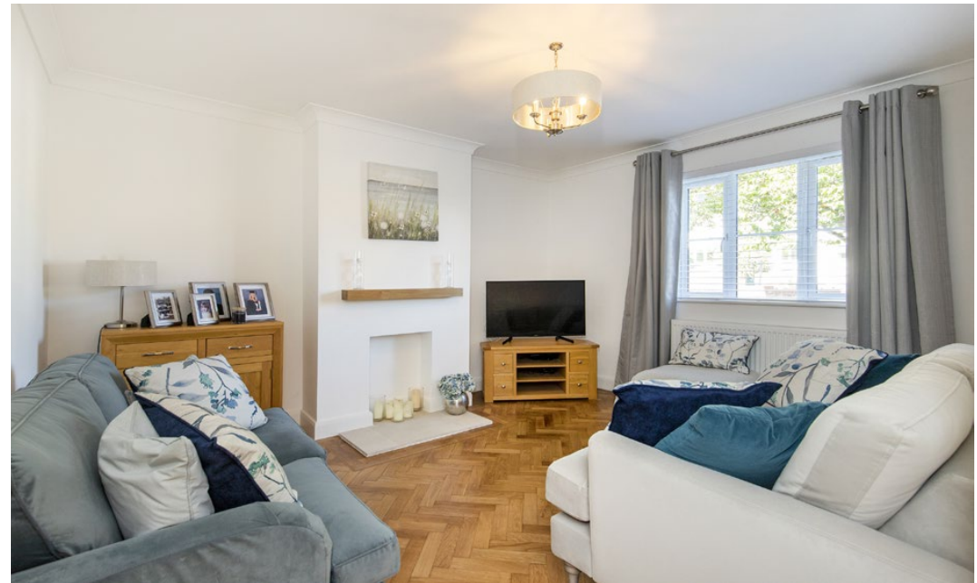
Kitchen and Sitting Room