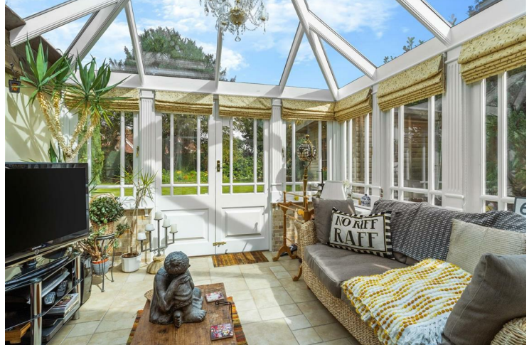
CONSERVATORY 12'9" x 11'1" (3.9 x 3.4)