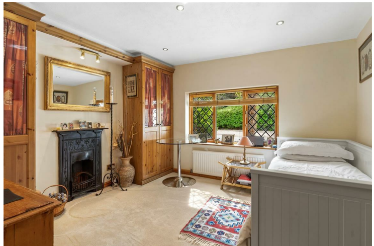
BEDROOM 3 11'5" x 10'9" (3.5 x 3.3)