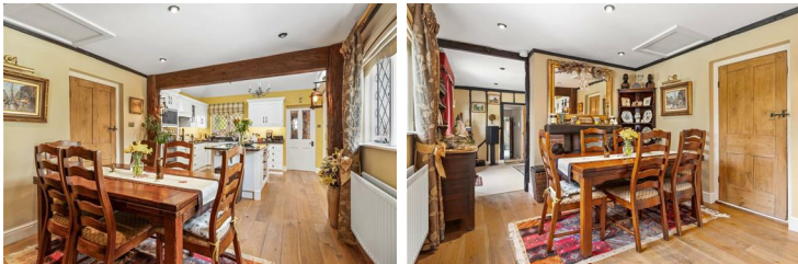
DINING ROOM 11'5" x 10'9" (3.5 x 3.3)