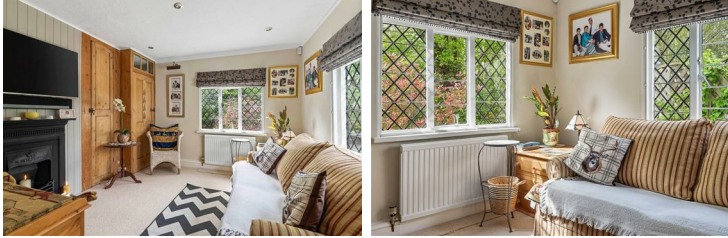
SITTING ROOM 11'9" x 11'5" (3.6 x 3.5)