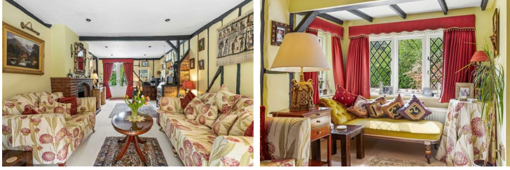
LIVING ROOM 23'3" x 11'1" (7.1 x 3.4)