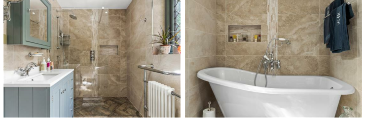
EN-SUITE BATH/SHOWER ROOM