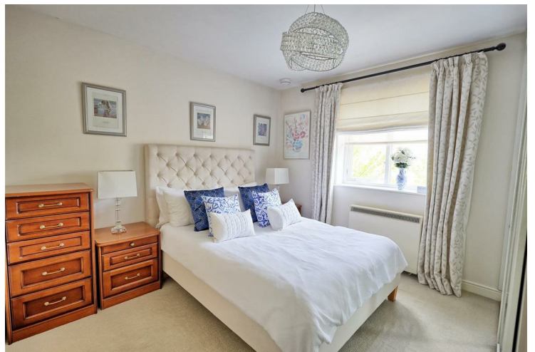
BEDROOM ONE 11'3" x 10'9" (3.45 x 3.3)