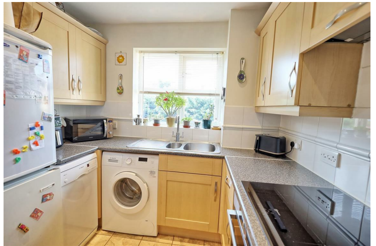
KITCHEN 9'3" x 8'0" (2.83 x 2.46)