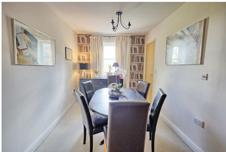
DINING ROOM 10'5" x 8'2" (3.2 x 2.5)