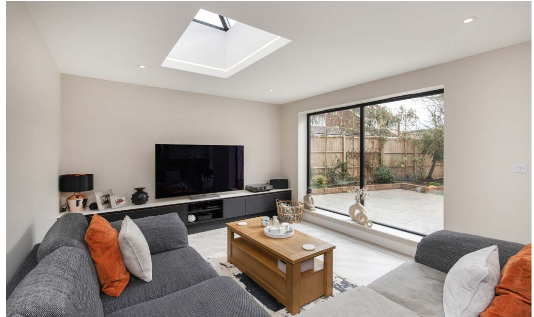
Other Ground Floor Images