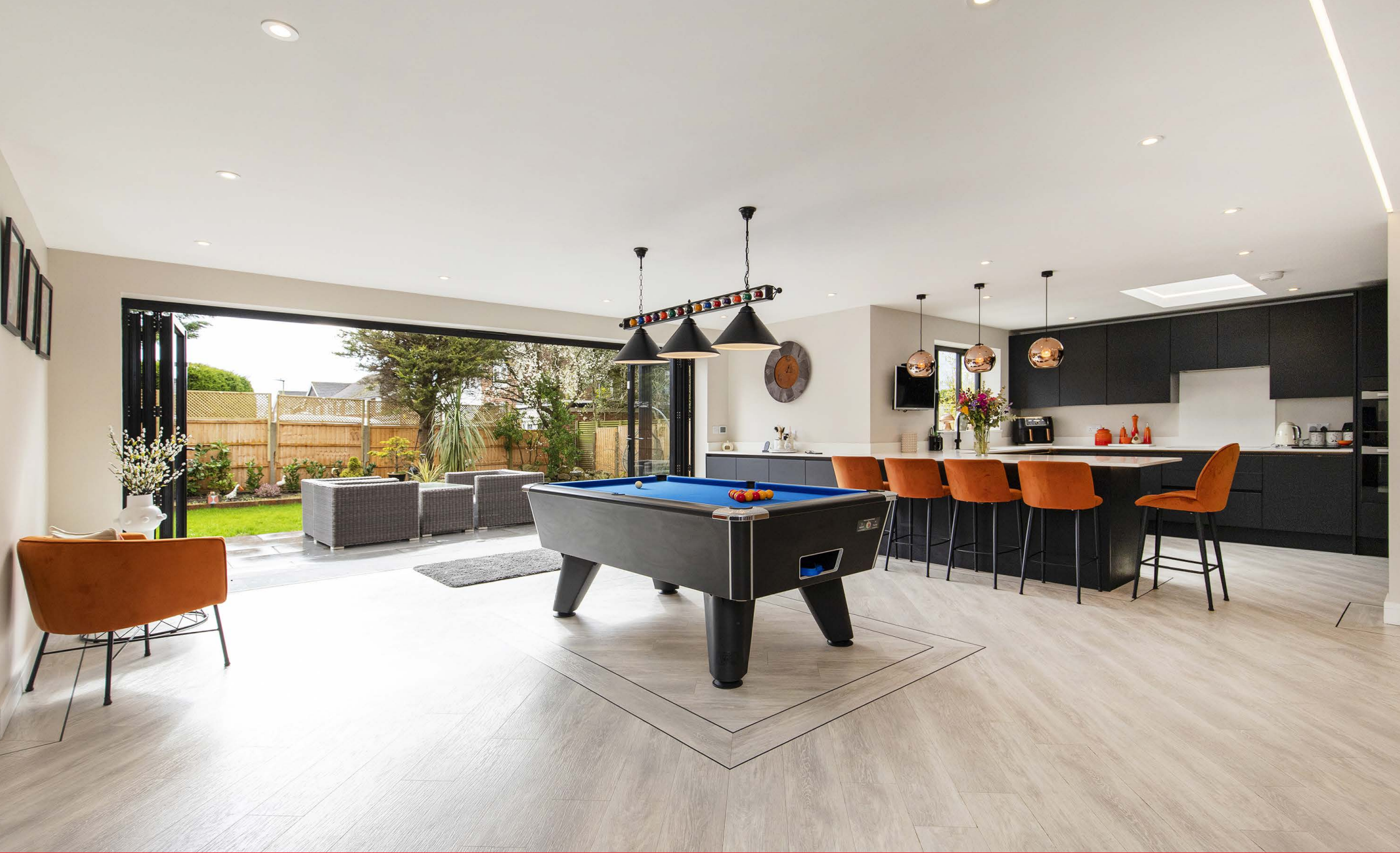
Open Plan Kitchen / Day Room