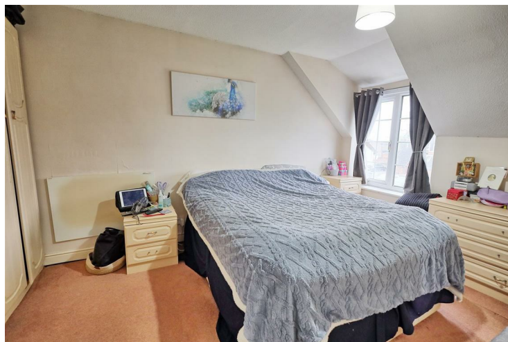
BEDROOM ONE 14'2" x 9'4" (4.32 x 2.85)