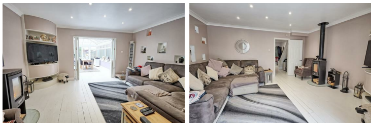
LIVING ROOM 15'1" x 12'5" (4.6 x 3.8)