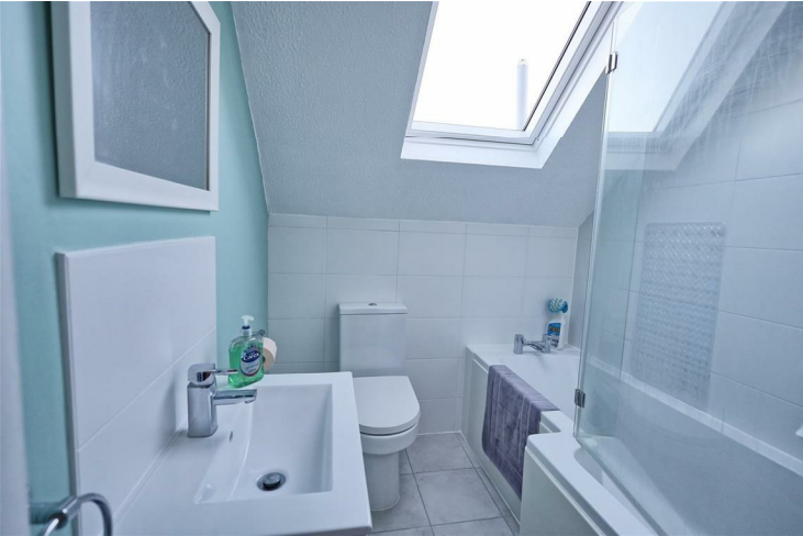
BATHROOM 5'11" x 8'3" (1.82m x 2.52m)