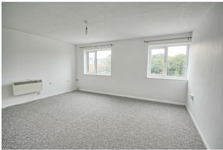
LIVING ROOM 16'4" x 13'1" (5 x 4)