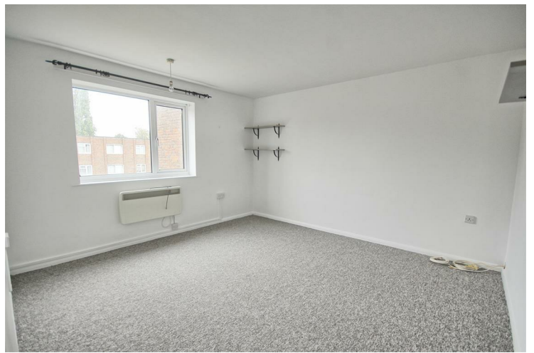
BEDROOM TWO 12'7" x 11'10" (3.84 x 3.61)