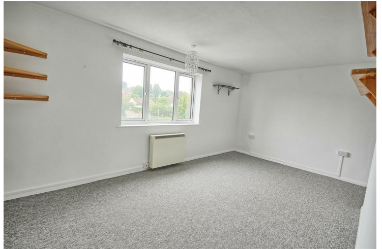
BEDROOM ONE 17'1" x 9'7" (5.22 x 2.93)