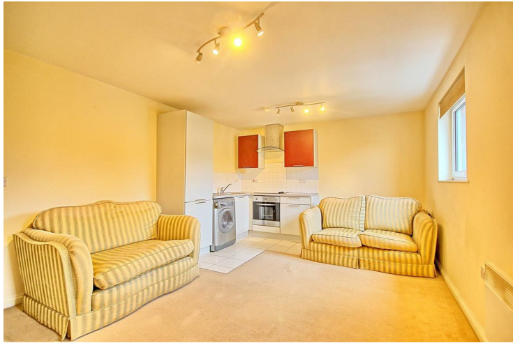
LIVING ROOM 11'9" x 16'0" (3.59 x 4.89)