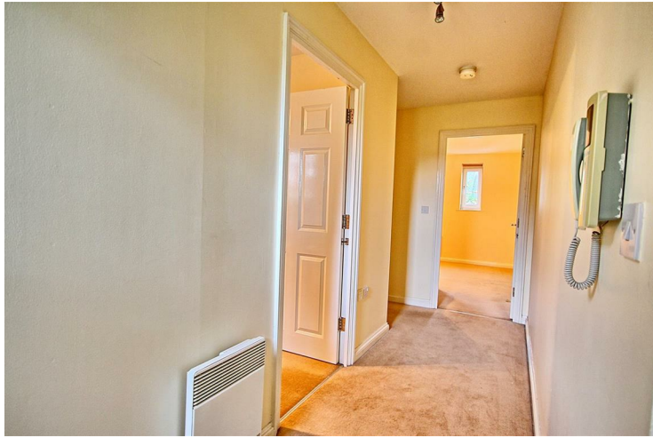
BEDROOM 10'5" x 12'6" (3.20 x 3.82 )