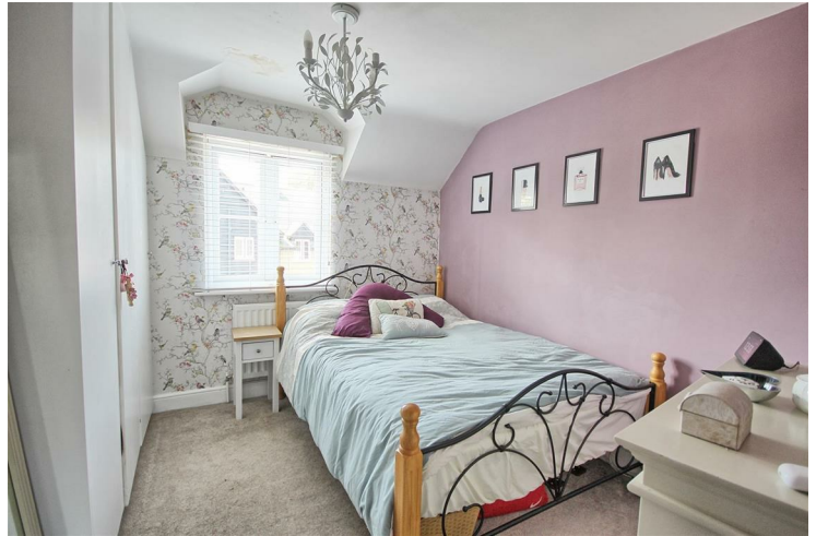
BEDROOM ONE 10'3" x 8'10" (3.12 x 2.69)