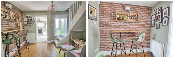
DINING ROOM 12'2" x 8'10" (3.71 x 2.7)