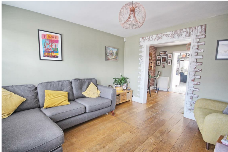
LOUNGE 12'0" x 11'7" (3.66 x 3.53)