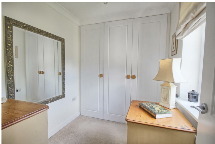
BEDROOM FOUR 6'10" x 6'2" excl wards (2.10 x 1.90 excl wards)