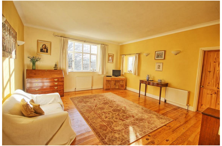
LIVING ROOM 16'4" x 15'1" (5 x 4.62)