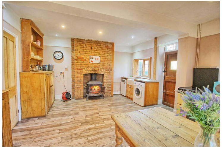
KITCHEN/BREAKFAST ROOM 14'11" x 14'9" (4.56 x 4.52)