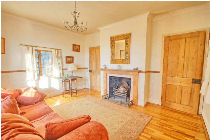
SITTING ROOM 14'3" x 12'2" (4.36 x 3.71)