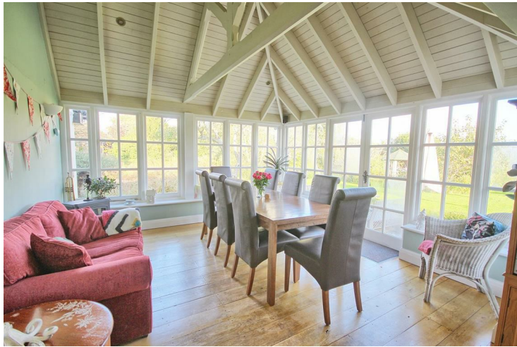
GARDEN ROOM 16'0" x 12'2" (4.88 x 3.73)