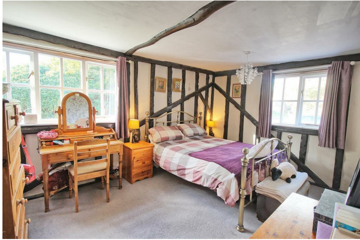
BEDROOM ONE 16'2" x 14'2" (4.95 x 4.32)