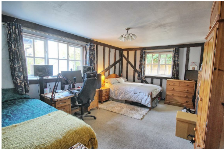
BEDROOM TWO 16'9" x 12'2" (5.13 x 3.71)