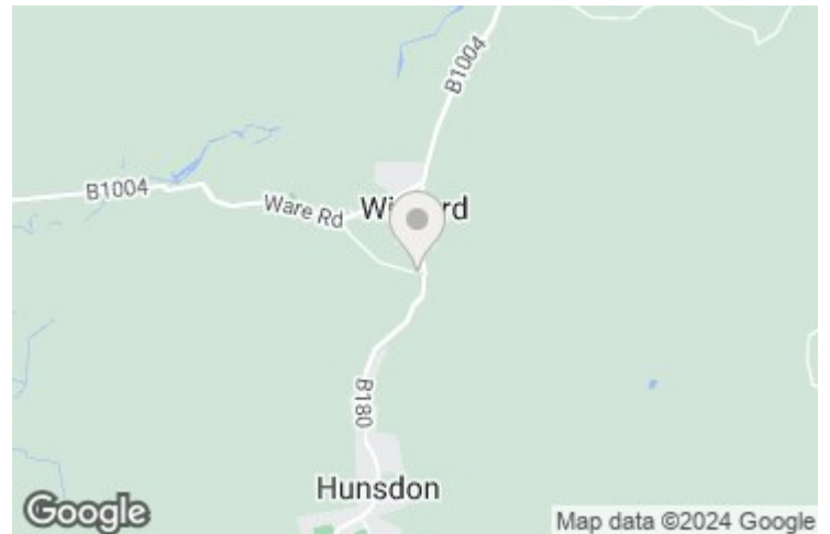
COUNCIL TAX BAND - E