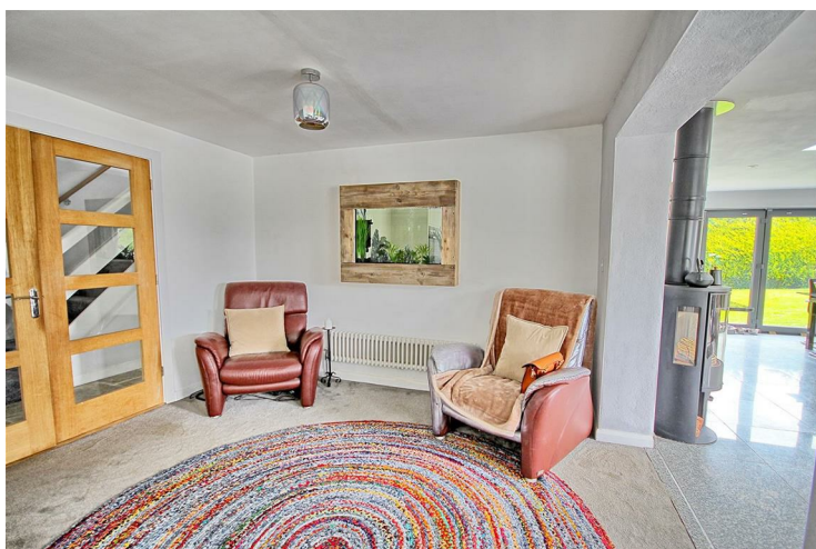
SITTING ROOM 11'0" x 9'5" (3.37 x 2.89)