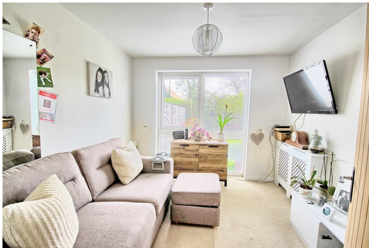
PLAYROOM/BEDROOM FOUR 9'9" x 9'6" (2.98 x 2.92)