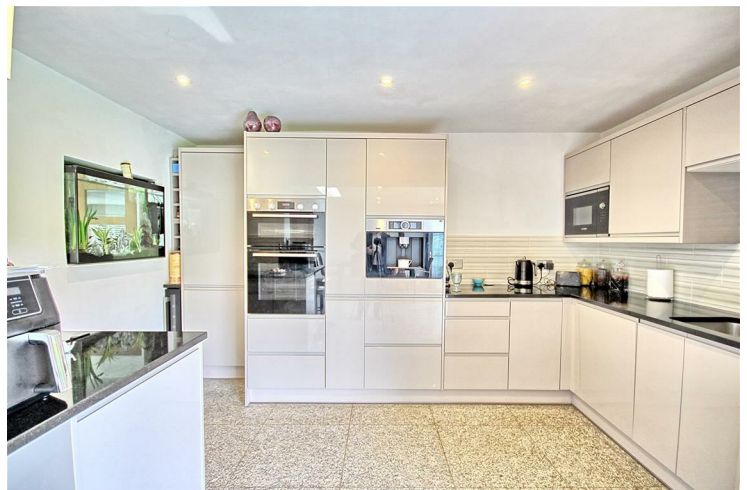
KITCHEN 13'1" x 9'0" (4 x 2.76)