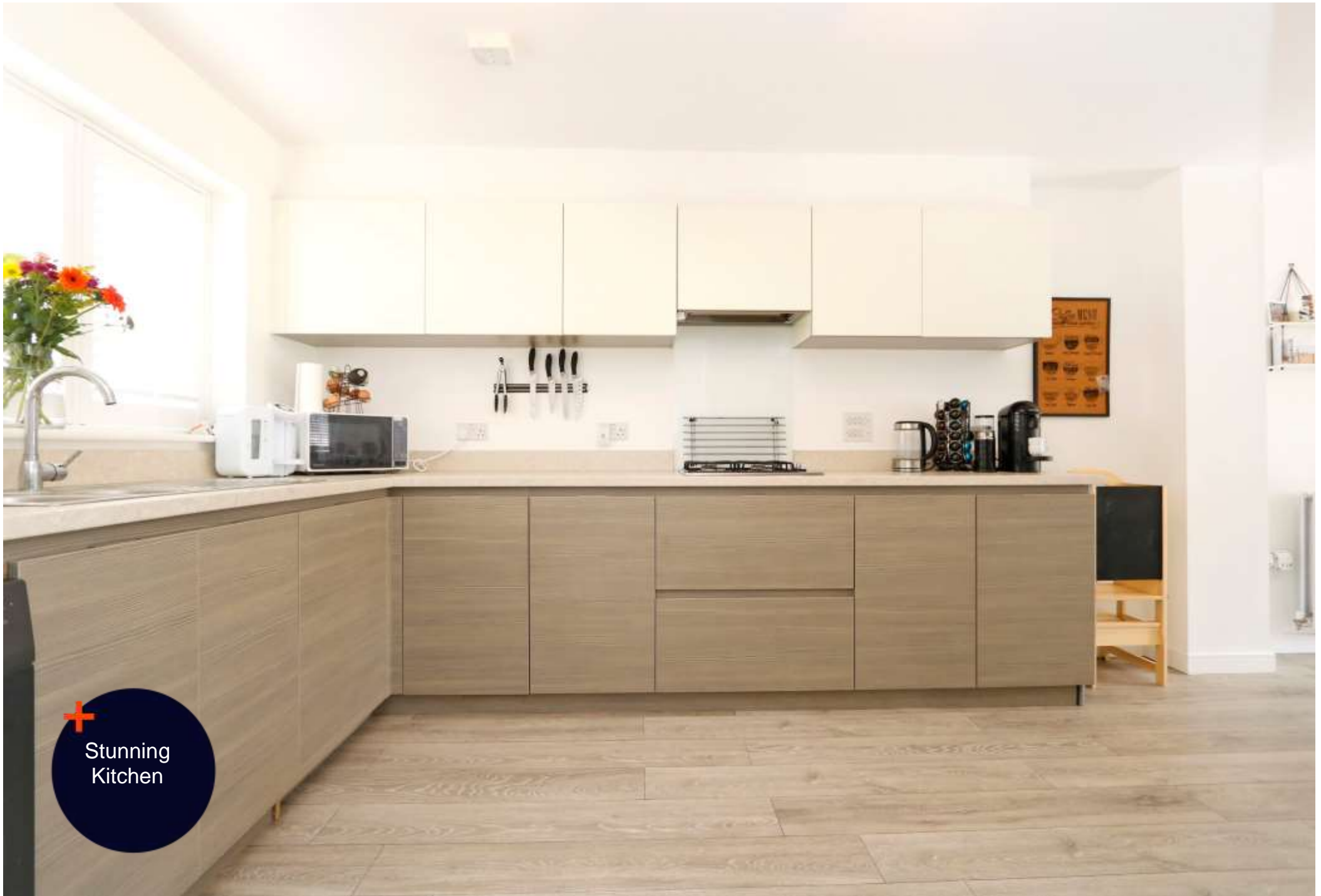
+ Stunning Kitchen