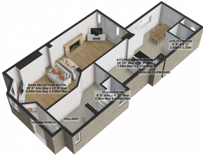
GROUND FLOOR 696 sq.ft. (64.7 sq.m.) approx.