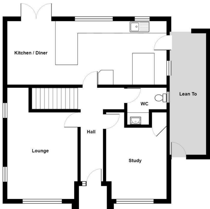
Area: 84.6 m 2 ... 911 ft 2