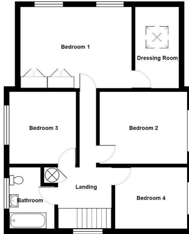
Area: 70.4 m 2 ... 757 ft 2