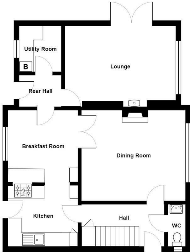
Area: 70.1 m 2 ... 755 ft 2