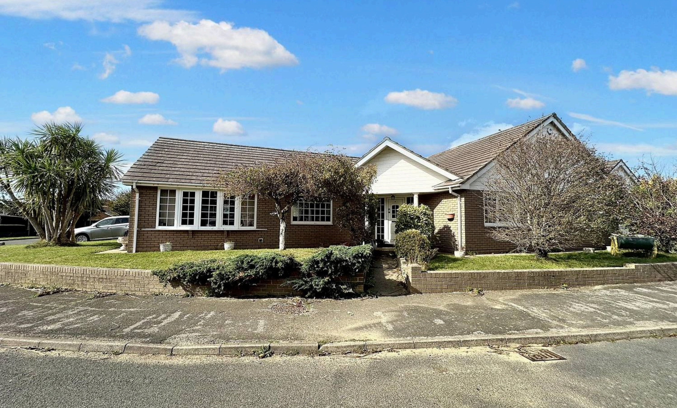
4 Mount Caburn Crescent, Peacehaven, BN10 8DW £650,000