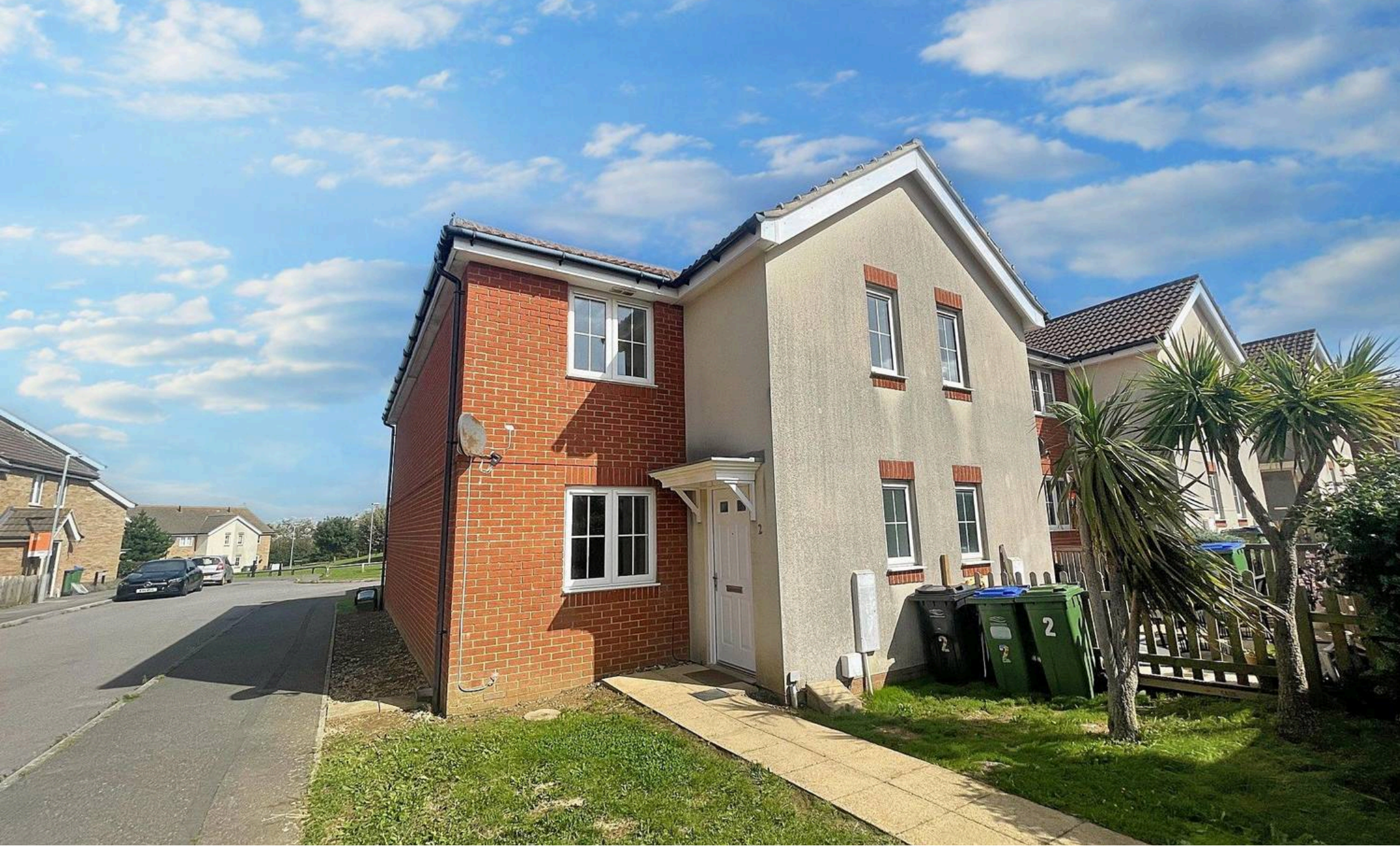
Montreal Close, Peacehaven, BN10 8FG £239,950