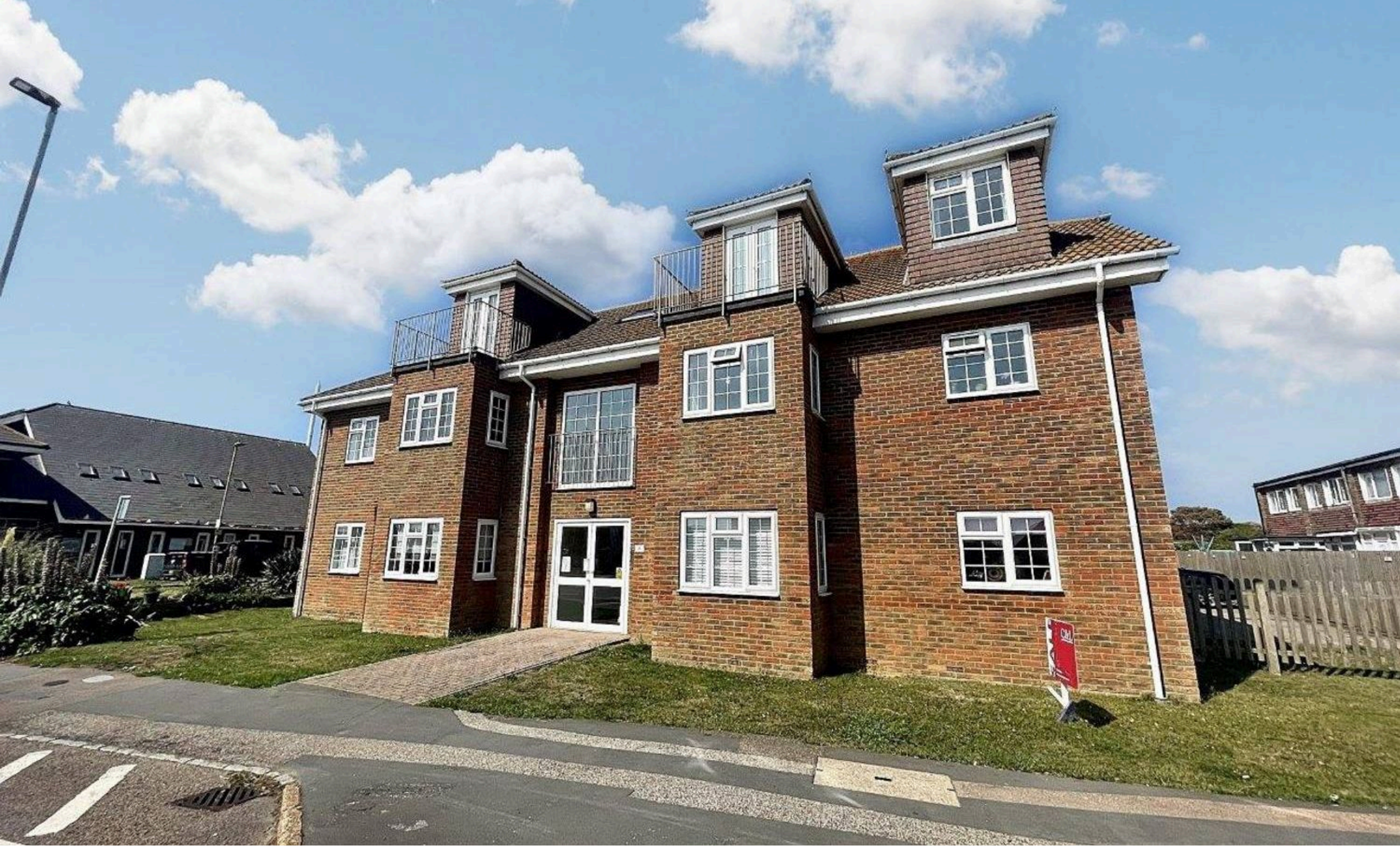
Flat 6 Central House, Central Avenue, Telscombe Cliffs, BN10 7LJ £239,950