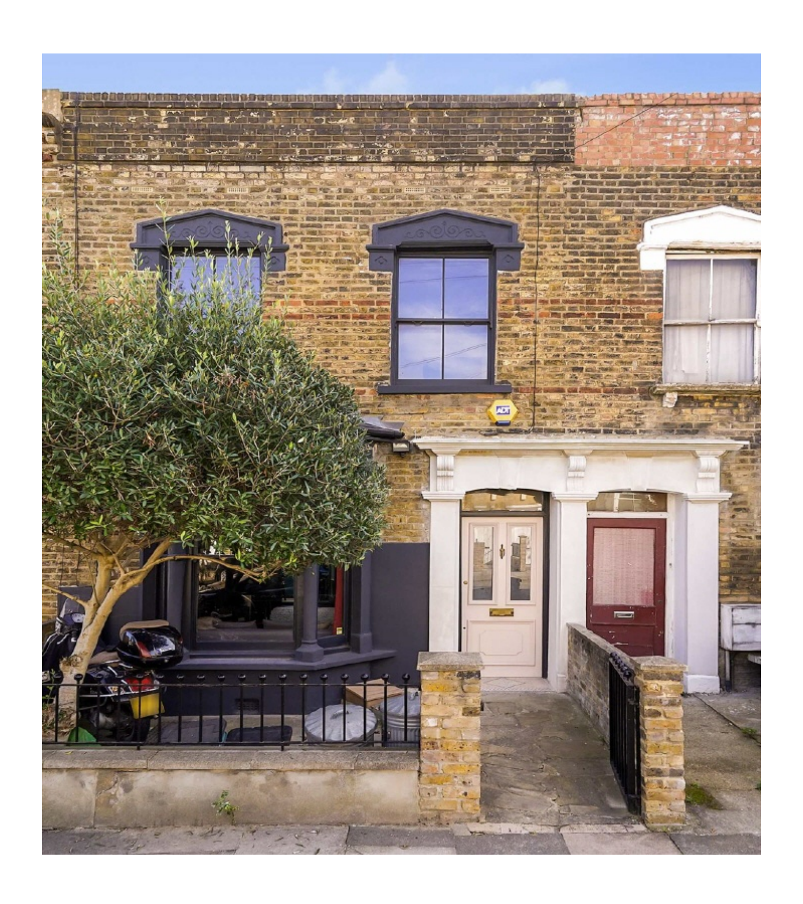
Canning Road, N5 £1,500,000