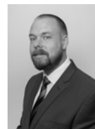
Professional photography GRANT LAWRENCE Photographer