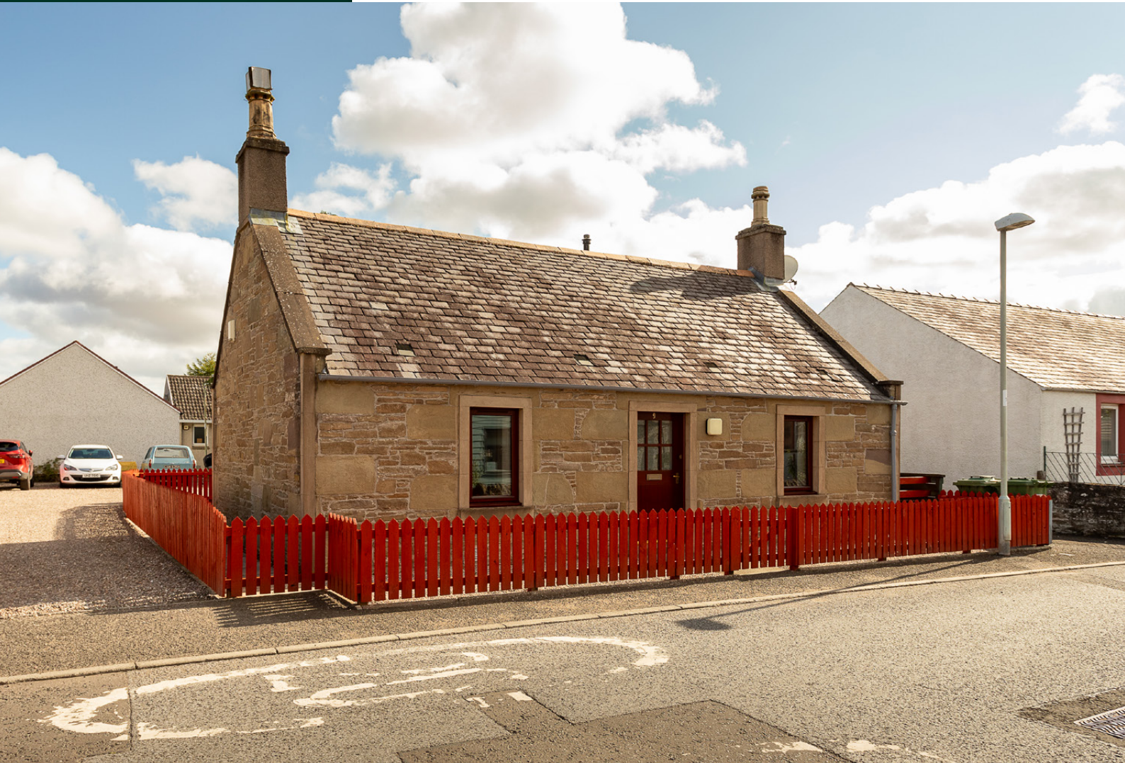
PICTURE-PERFECT TWO-BEDROOM COTTAGE