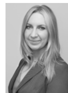
Professional photography LEIGH ROLLO Photographer